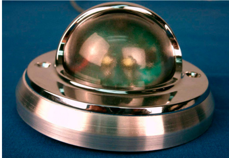
Part #: 360-LST-01

For Stairwell Entrance Door Applications