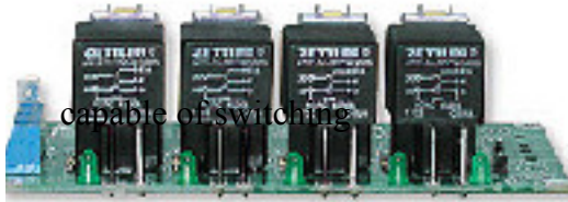
PDC-4 Part #: S290-0147A

Convenient output terminal strips make load connections easy and accessible. The input connectors can be removed without removing any connections. All outputs have LED fault detection circuitry to assist with field troubleshooting. All relays have the ability to be enabled using either a ground (-) or a positive trigger. The relays are pre-connected to the buss bar to provide +12 VDC outputs. Two relays on the PDC-10 have "on board" switches to permit switching ground through these positions. The PDC-10 has a single relay either power or ground. These boards are manufactured by TST to provide years of trouble-free service.