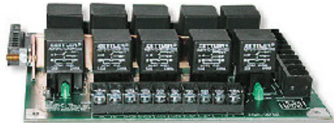
PDC-10 Part #: S29-2010