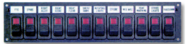
12 Position Express Panel- Euro

TST Express Panels are made of 0.060 inch thick aluminum with a black powder coating applied. Each panel also includes an 18 volt backlighting strip with 9 inch power leads, radius corners, and 0.156 inch mounting holes.